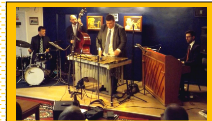
"PORTRAIT OF THE M.J.Q." APRIL 2018

MARLOW SL7 1NT (GO TO HOME PAGE FOR DIRECTIONS)